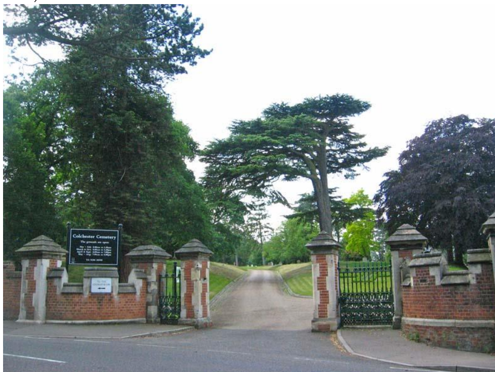
Colchester Cemetery Entrance

Colchester Cemetery was opened in 1856 and now belongs to the Corporation. It originally covered about 30 acres, but was enlarged in 1940 to 67 acres. The newer part is on the western side of the original burial ground, and behind it is the site of a Roman Way. There are 267 Commonwealth burials of the 1914-1918 war, 1 being unidentified, of which 50 are in the War Plot, while 11 Australian graves are together in a group nearby, the remainder being scattered. After the war a Cross of Sacrifice was erected on a site overlooking both the plot and the group of war graves, in honour of all the servicemen buried here. There are also 114 Commonwealth burials of the 1939-1945 war here, 1 of which is unidentified. In the early months of the 1939-1945 War, shortly after the enlargement of the cemetery, land was set aside in the newer part for service war burials. This is now the War Graves Plot. Among these casualties are men who were killed at sea after being evacuated from Dunkirk. The non-war graves are those of a man of the Merchant Navy and two ex-servicemen who were buried in the War Graves Plot although their deaths were not due to war service. There are also 7 Foreign National burials. The plot is enclosed by a hedge of cotoneaster frigida and a Cross of Sacrifice stands on the western side. The graves are set in level mown turf, with continuous flower borders along the rows of headstones in which are polyantha roses and other seasonal flowers. (Information from CWGC)