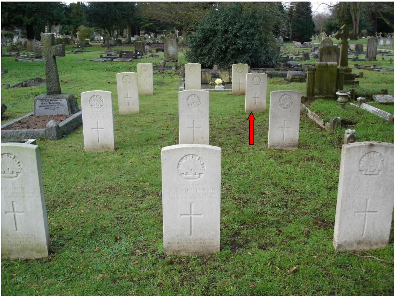
Australian Plot of World War 1 War Graves, Colchester Cemetery Private J. Hought's CWGC Headstone (marked with red arrow)