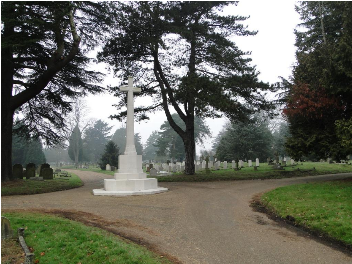
Cross of Sacrifice, Colchester Cemetery